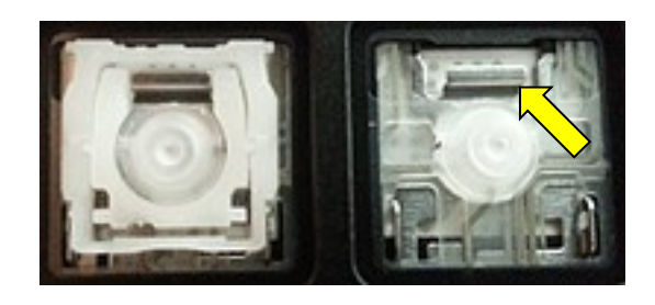
Step Two - Orient hinge mechanism and begin installation.

To install the hinge mechanism, begin by hooking one end over the large metal tab located on the keyboard. A small flat screwdriver or blunt tweezers will assist you in this step. Keep the flattest side of the hinge facing up so it is able to properly receive the key cap.